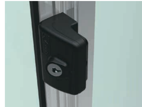
Exclusive proprietary handle for ease of operation with optional colour finishes.