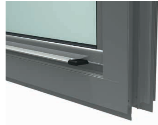
Integrated sash handles with protective end caps.

All Carinya double hung window sashes feature corner blocks in all four corners of the sashes. These blocks make the sash more rigid, reducing twist and movement. This reduction in movement increases the performance of the window by reducing opportunities for air, water and dust infiltration.