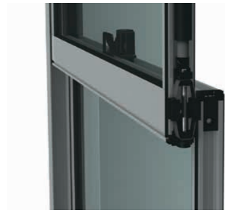
Adjustable tensioning spiral or spring system.