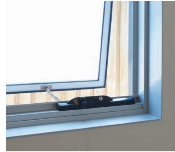
Chain winder with optional sash restriction.

The integrated 50mm sill allows for a stable base for your window, allowing concealed fixings and comes complete with stylish end caps.