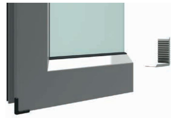
Commercial grade aluminium corner stake assembly.